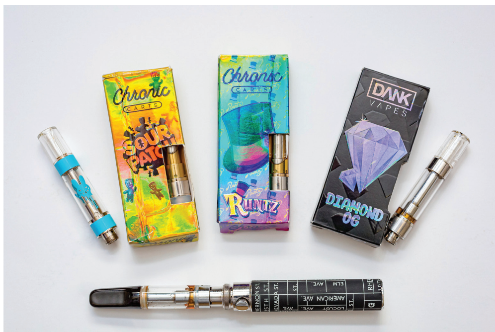
Mike Wren/New York State Department of Health

Some of the cannabis-containing vaping products contain high levels of vitamin E acetate. Vitamin E acetate is a key focus of the investigation of potential causes of vaping-associated pulmonary illnesses.