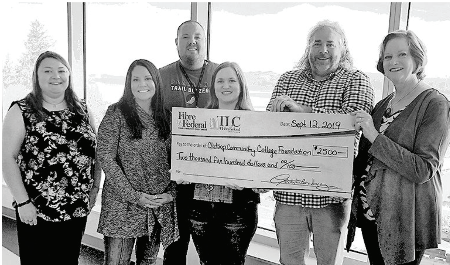
TLC/Fibre Federal Credit Union