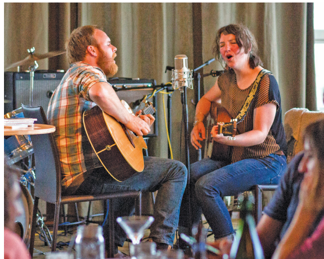
The Hackles will play at the Fort George Brewery and Public House's Regatta block party on Saturday, Aug. 10.

The brewery will also host Miss Lonely Hearts and Lonesome Heroes at 7 p.m. on Sunday, Aug. 4. There