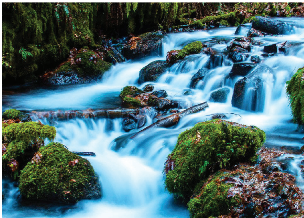
"Wahkeena" fine art photograph by Dale Veith at Fairweather House and Gallery.

Featuring antique cobalt blue glass. The characteristic bright dark blue identifies it for the collector. Most cobalt glass found today was made after the Civil War. It was made using oxide of cobalt.