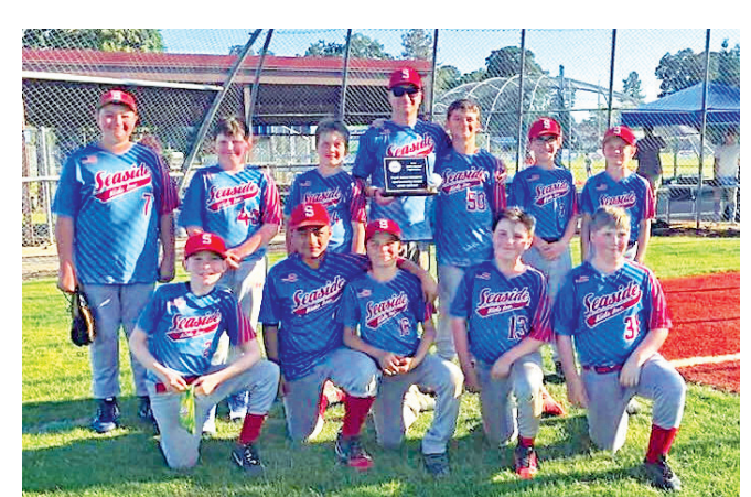
Fourth place at state for Seaside baseball's Junior team.

Elsewhere, Seaside's Senior American team (grades 7-8) placed fourth at districts, and was also selected for the Sportsmanship Award by the umpires, coaches and tournament directors.