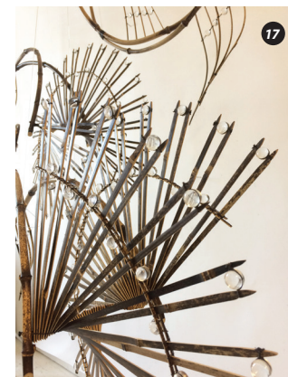
Charissa Brock's "Float" at RiverSea Gallery.