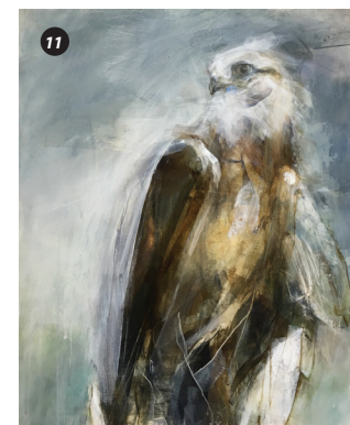
Bethany Rowland's 2019 "When Looking Becomes Sacred" acrylic on clayboard on view at Imogen Gallery.