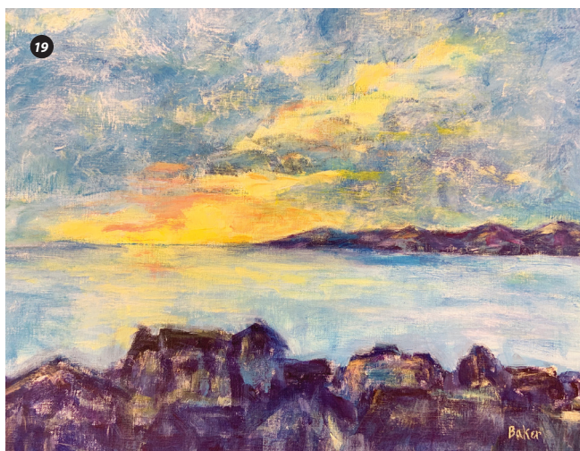
Vicki Baker's acrylic "Astoria River View" at TEMPO Gallery.