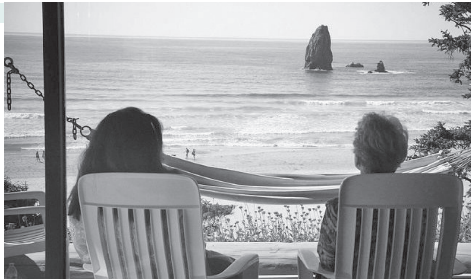
Cannon Beach History Center & Museum