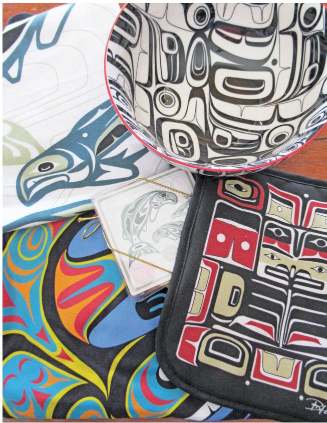
Prizes for the Lummi Nation fundraiser.

The fundraiser is sponsored by Astoria's Pacific Unitarian Universalist Fellowship, which is joining with other West Coast congregations to honor the Pacific Northwest's deep connections with native people.