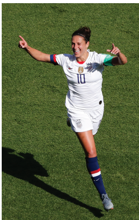
Carli Lloyd celebrates after scoring the opening goal against Chile.

"I love the balls coming towards me and being able to showcase my skills," she said through a translator. "Obviously it's difficult to maintain concentration. I think in the first half it was difficult for me to get into the game. I think the second half went better for me and in general for the team."