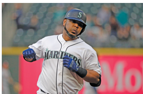
Seattle Mariners' Edwin Encarnacion rounds the bases after hitting a solo home run against the Houston Astros.

The 36-year-old Encarnacion has hit 21 home runs this season and has averaged 37 homers and 109 RBIs in his last seven years. He is owed $11,397,849 of his $20 million salary this year plus a $5 million buyout of a