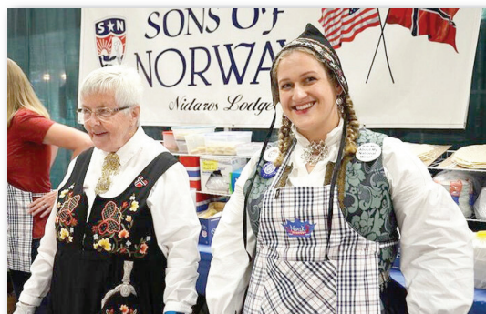
Vendors representing the Sons of Norway.