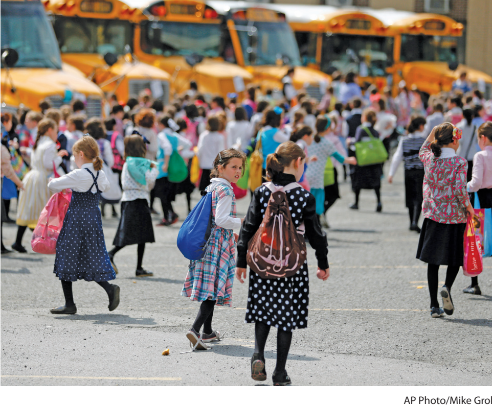
Orthodox Jewish girls walk to waiting buses after summer day camp in 2014 in Kiryas Joel, New York. Kiryas Joel is a tightly packed Hasidic enclave surrounded by suburbia in the Hudson Valley.

ease Control and Prevention reported that, as of June 1, more than 1,000 measles cases had been reported in the U.S. since the start of the year, up from fewer than 100 cases a year a decade ago. The bulk of those cases have been diagnosed in ultra-Orthodox Jewish neighborhoods in Brooklyn and suburban Rockland County.