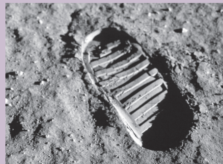
The footprints could stay on the moon for millions of years since there is no wind or rain to disturb them!

Back on Earth, people all over the world had been sitting on the edge of their seats as they watched and waited to know if the spacecraft was safe. They held their breath as it became apparent that fuel was running low. When these famous words came across their televisions and radios, cheers went up worldwide!