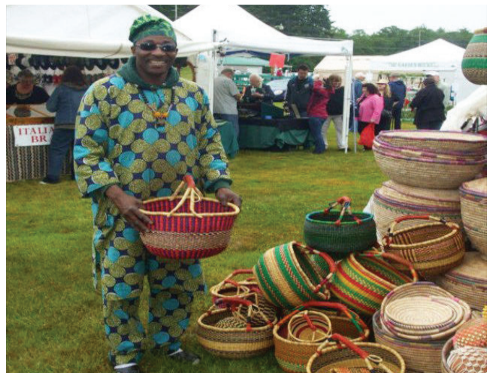
Baskets at the Northwest Garlic Festival.