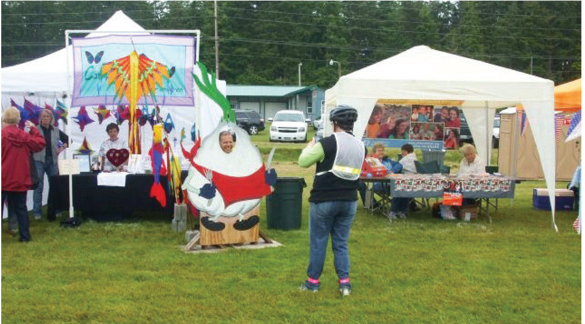
Attendees take advantage of a garlic photo opportunity at the Northwest Garlic Festival.

Another new vendor will be selling magnetic jewelry and handing out garlic recipes.