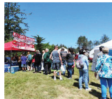
Attendees at the 2018 Northwest Garlic Festival.