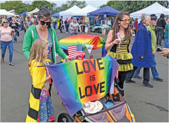
Attendees listen to presenters at the Astoria Pride block party.