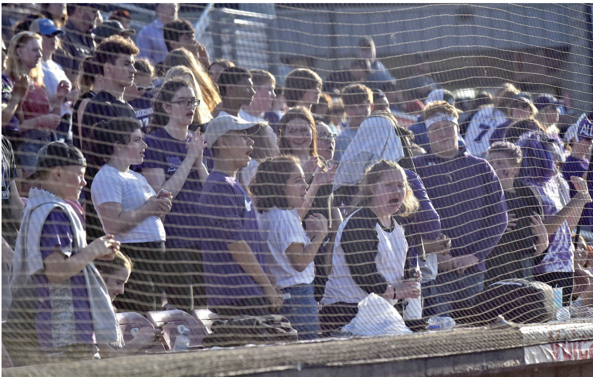
Warrenton students cheer on the Warriors in the state championship baseball game.