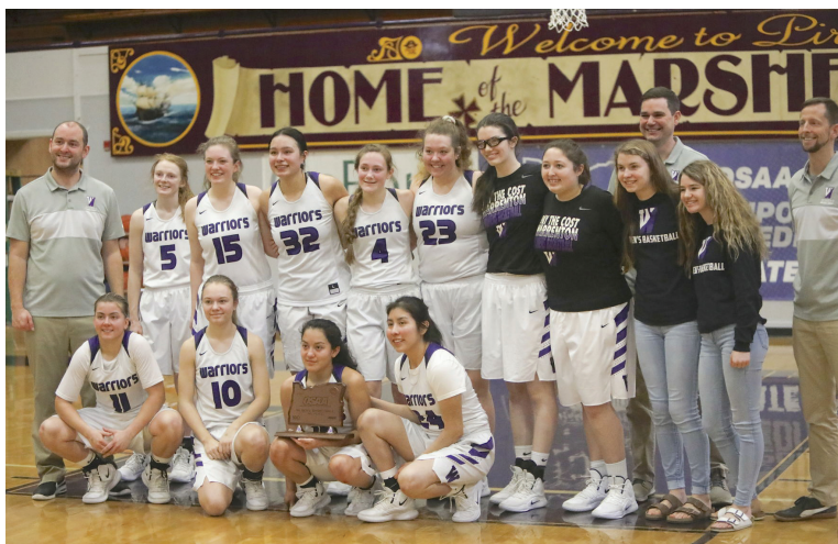
The girls basketball team won Warrenton's first team trophy of the year at the state level, placing sixth in the Class 3A state tournament.