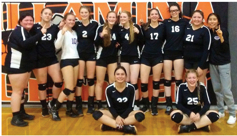
Warrenton's volleyball team.