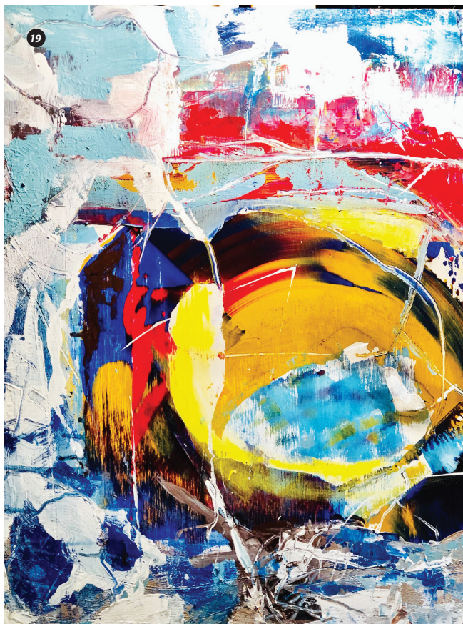
Renee Rowe's painting "Turnings of the Wheel" is on view at the AVA Gallery.