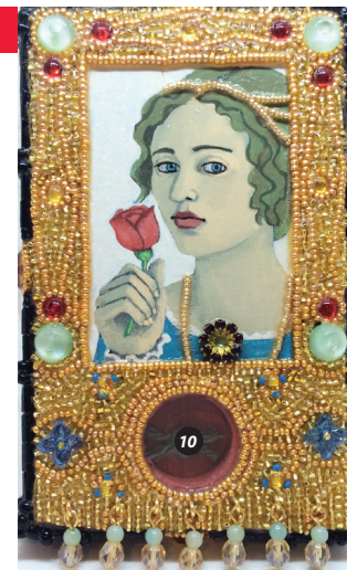
Zemula Fleming's "Reliquary Love Knot" is on view at Forsythea.