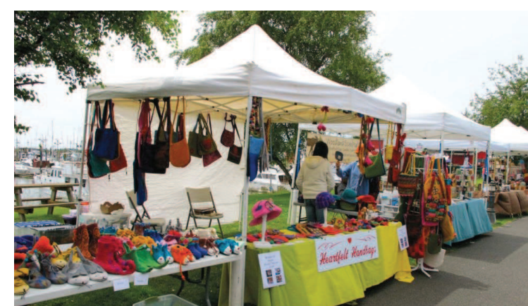
Colorful arts and crafts booths line the waterfront each week during the Saturday Market at the Port of Ilwaco.

10 a.m. to 5 p.m., Cannon Beach Library, 131 N. Hemlock St., Cannon Beach. Hundreds of rare, old and classic books, $1 to $600, most under $10, including first editions, author-signed books and collectable editions. Priced below equivalent books selling online or in used bookstores.