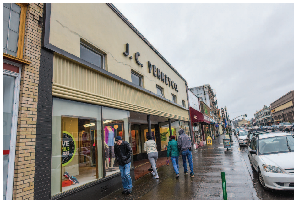
People walk by the J.C. Penney building on Commercial Street before it closed in 2017.

The successes are numerous. Ask Astoria architectural historian