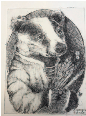
"Asparagus Farmer" by Jill McVarish

cent of Dutch masters, she weaves complex mazes of texture and color within each composition. Scale and precision are always at the forefront of her work.