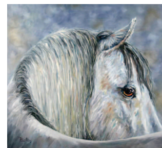
"Looking Back" oil by Blue Bond at Blue Bond Art Studio and Gallery