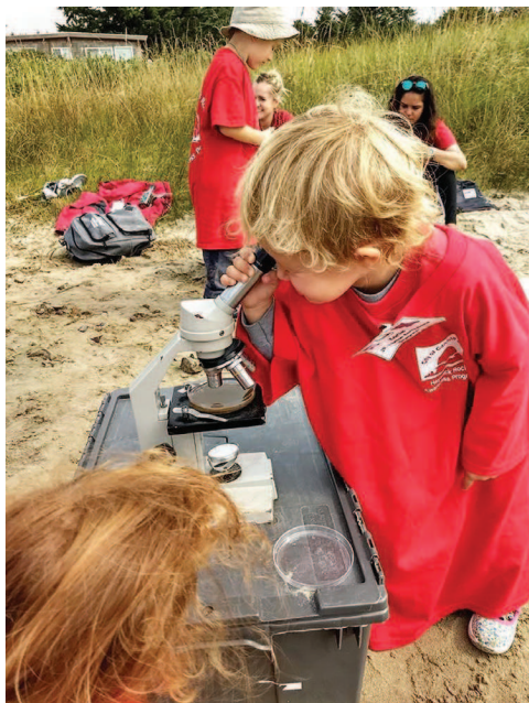
Haystack Rock Awareness Program

Enrollment is $150 per participant. Tickets can be purchased through Eventbrite via Facebook, HRAP's website or the Eventbrite website. Reserve your spot soon