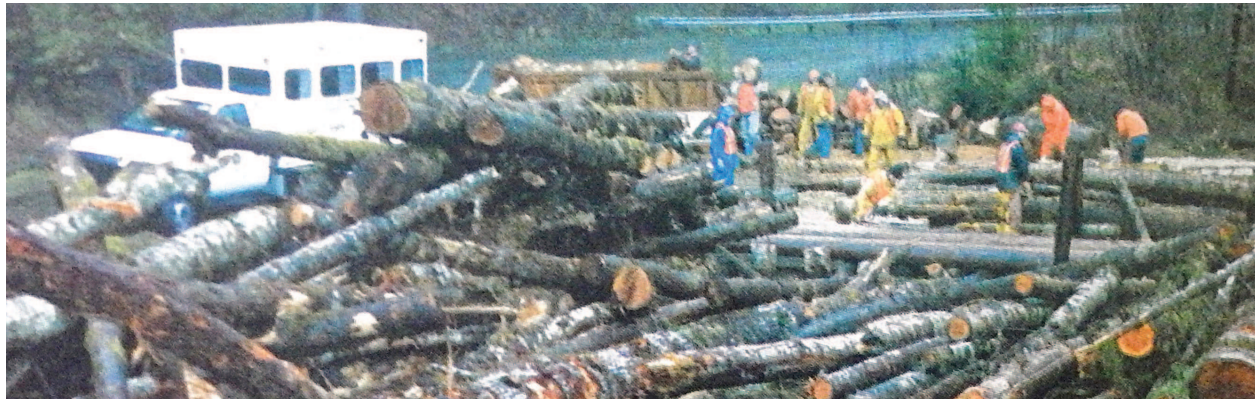
The Daily Astorian

A 15-star, 15-stripe flag of the sort flown over Fort Clatsop by the Lewis and Clark party will be sent by an Astoria woman to Rep. William Hungate of Mis-