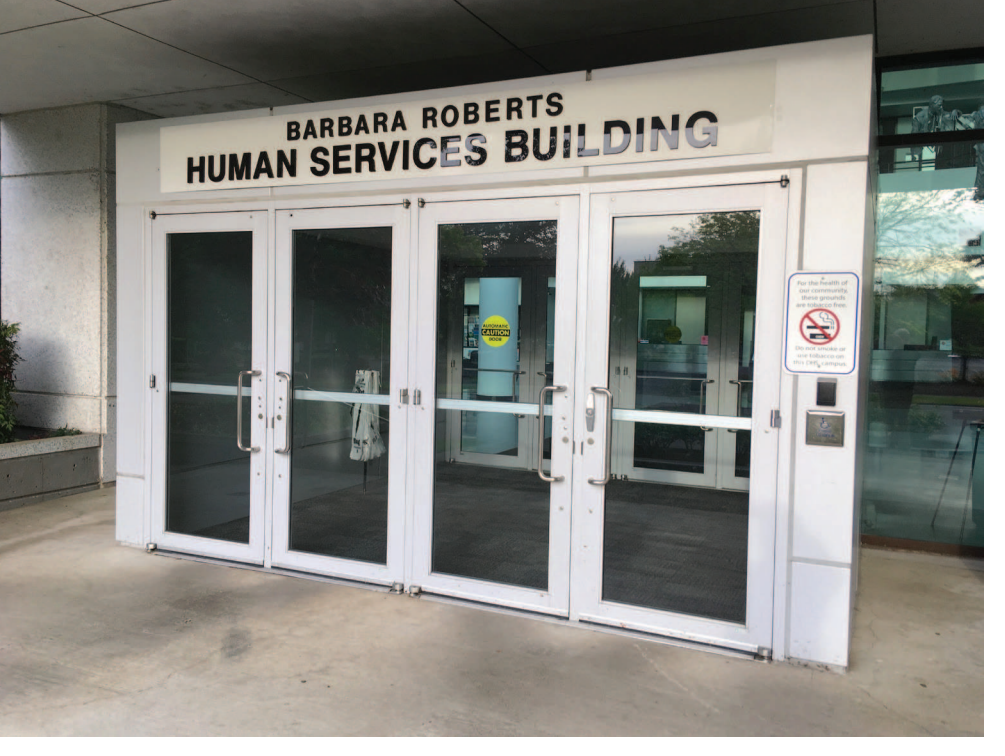
Information at the state Department of Human Services was exposed in a data breach.