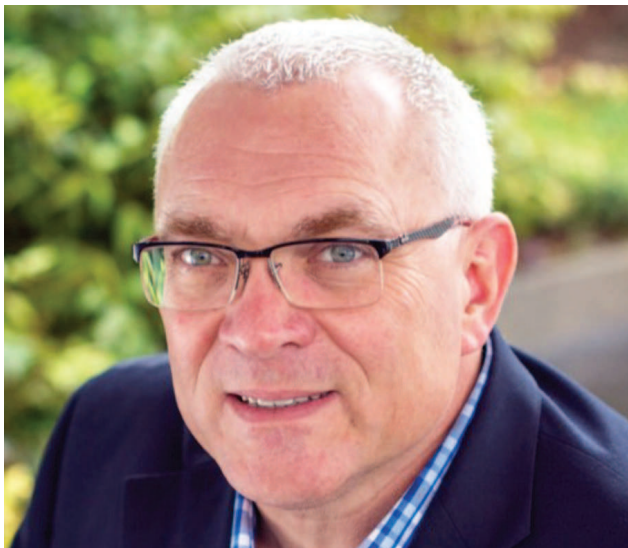
Columbia Pacific Heritage Museum

Salty Talks are held in partnership with the Salt Pub & Hotel, Columbia Pacific Heritage Museum, and the Washington State Parks and Recreation Commission, with support from Friends of Columbia River Gateway.