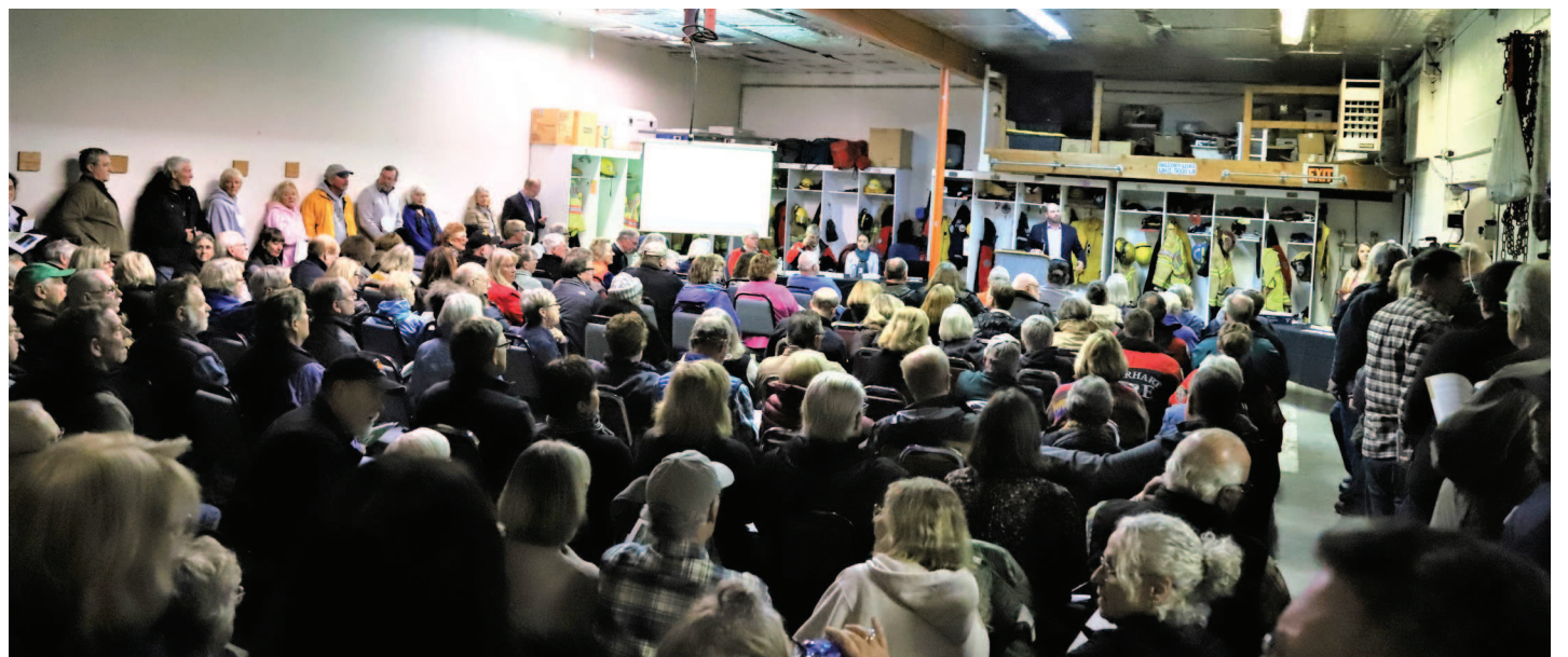
Gearhart residents packed the fire station to consider a new firehouse location.

There are Gearhart Fire Department volunteers today who weren't even born then.