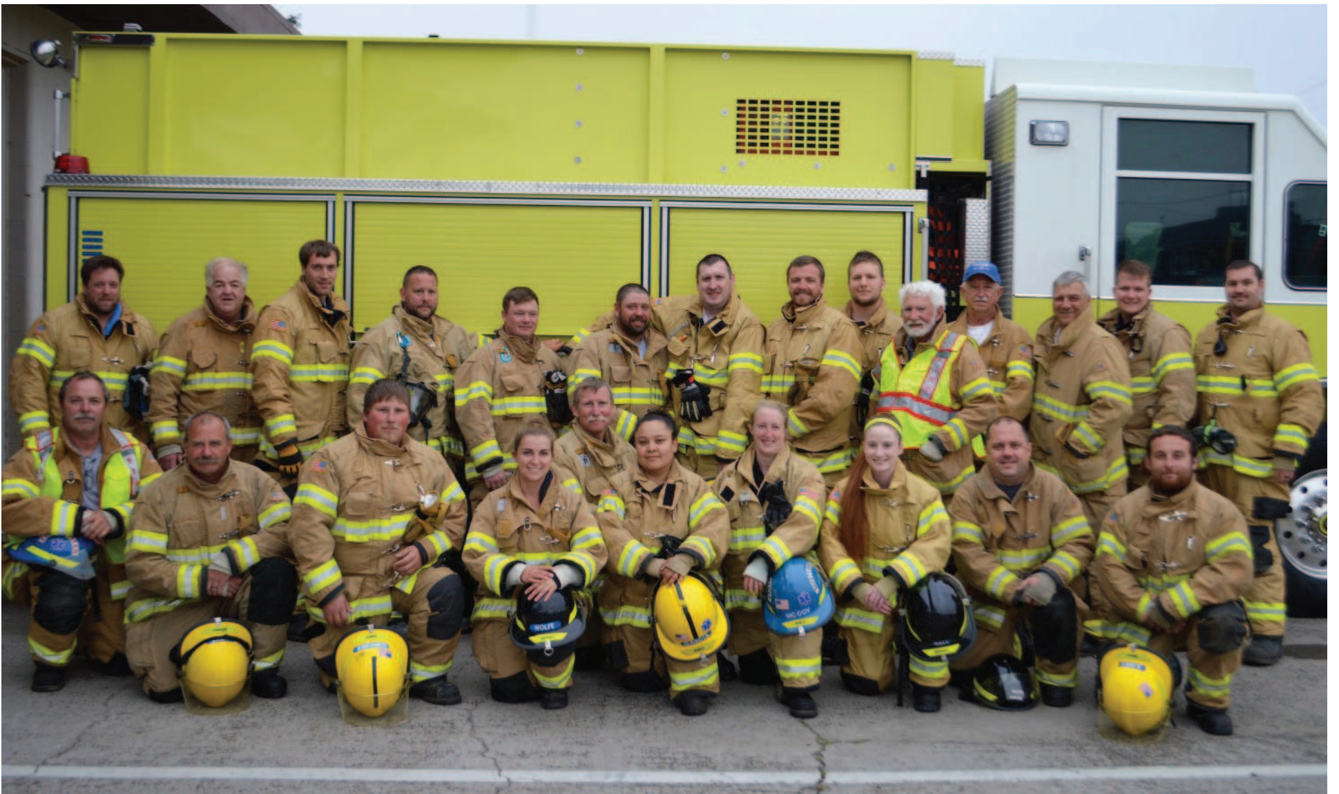
Members of the Gearhart Volunteer Fire Department.