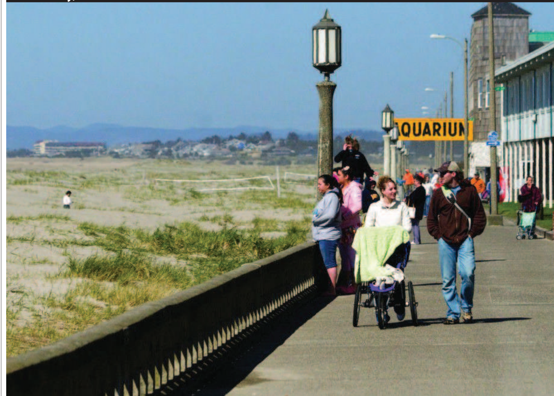
The Prom in Seaside offers great views for a beachfront stroll.