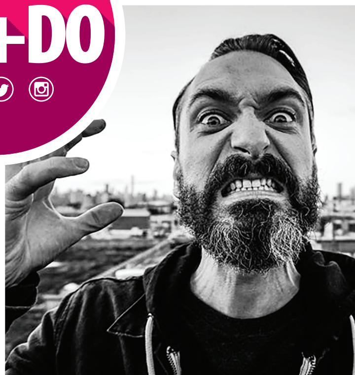
Labor Temple Bar