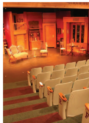
File photo Coaster Theatre Playhouse.

Both camps are available to students ages 8 through 12 or in third through sixth grade. The $135 tuition is covered by the Cannon Beach and US Bank Community Grants. There is a $50 activity fee.