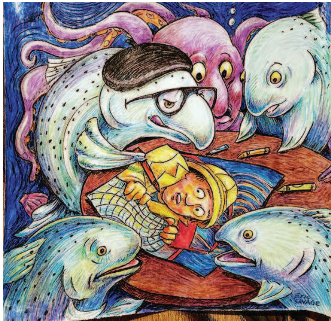
Silver Salmon Grille