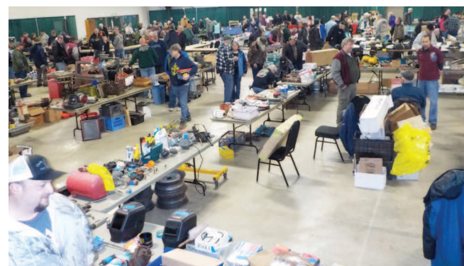
Lower Columbia Classic Car Club

The exhibit hall will be filled with a wide variety of parts for all makes and models of vehicles, from the 1920s to 1970s, as well as miscellaneous and collectable items. In the indoor arena you will find everything from engines to hoods, fenders, wheels