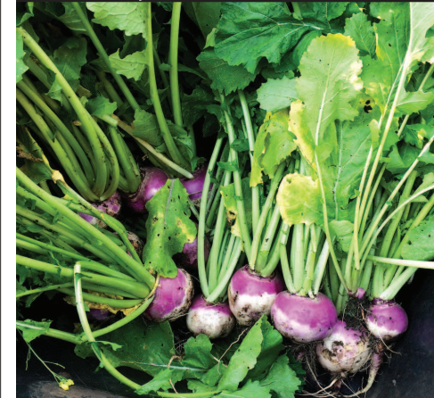
Alder Creek Farm