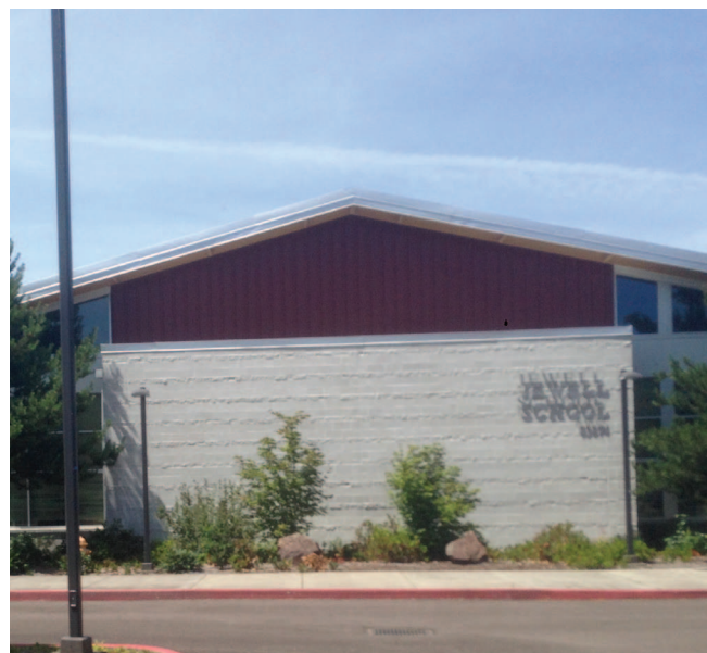
Jewell School is closed because of a flu outbreak.

The county sent a nurse to Jewell to administer up to 55 free doses of flu vaccine, some of it borrowed