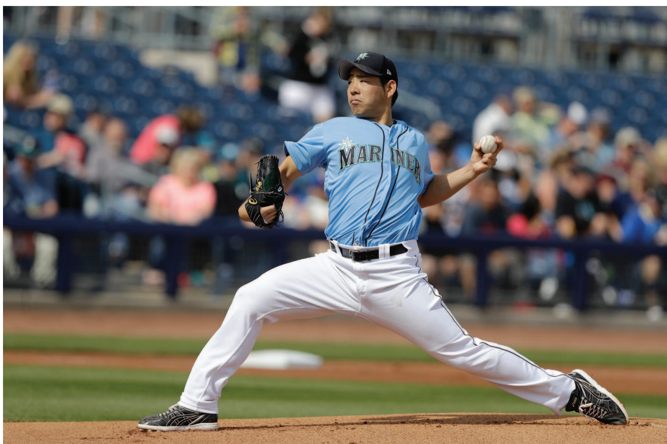
Yusei Kikuchi throws against the Cincinnati Reds.