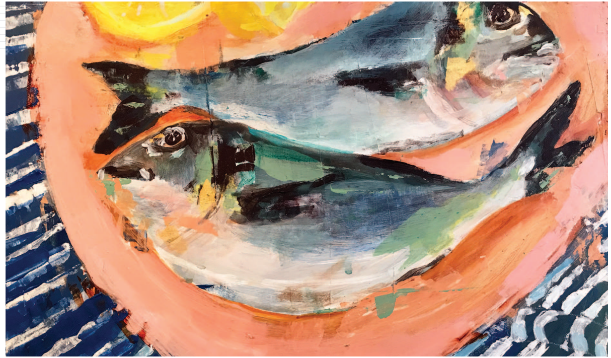
Drea Frost's painting 'Today's Catch.'