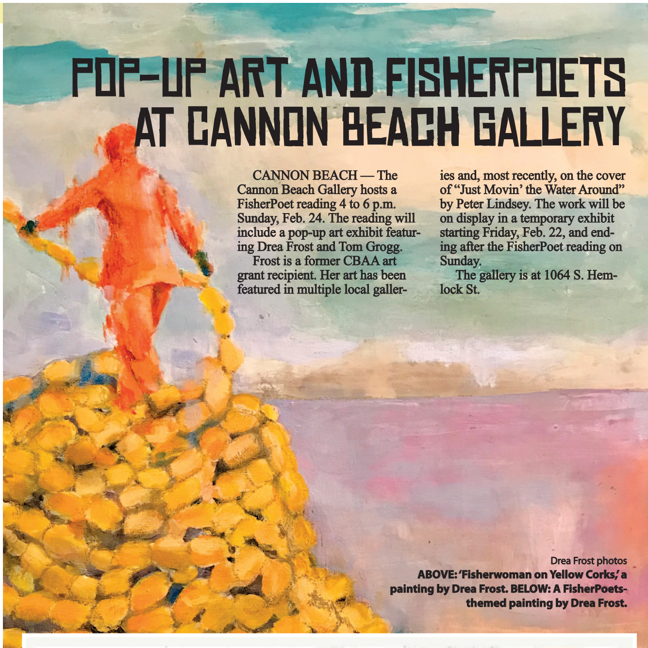
Drea Frost photos

ABOVE: 'Fisherwoman on Yellow Corks,' a painting by Drea Frost. BELOW: A FisherPoets-themed painting by Drea Frost.