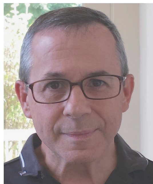
Astoria Hall of Fame