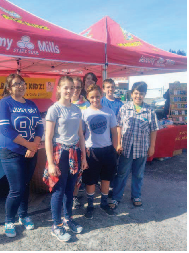
A 2017 Biz Kidz group shot.

The full schedule of dates and locations will be provided at the Open House and posted online at AstoriaSundayMarket.com.