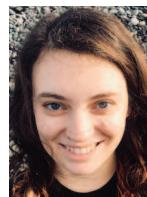
Astoria Visual Arts