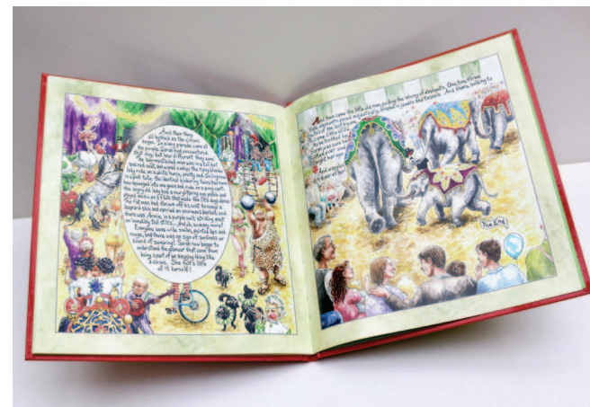
Astoria Visual Arts