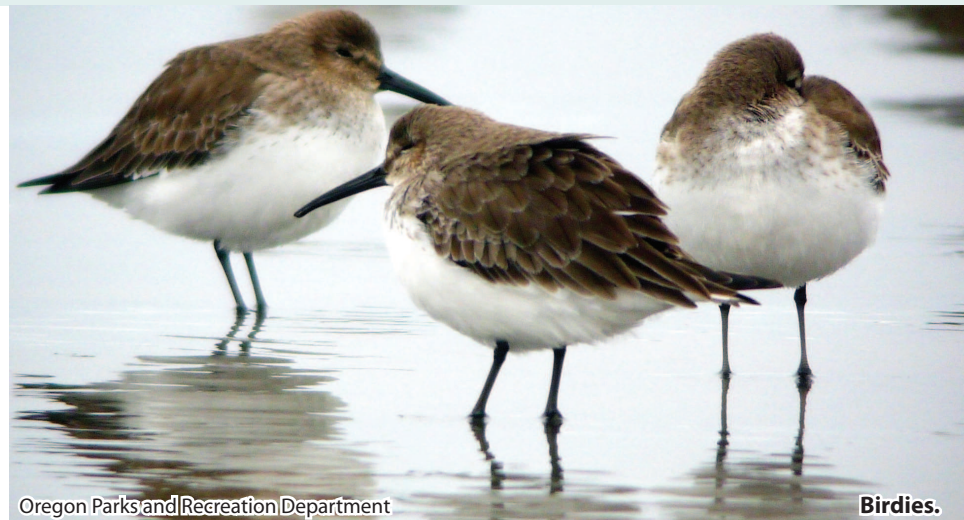
Oregon Parks and Recreation Department

Details about this and other North Coast Land Conservancy volunteer opportunities are at NCLCtrust.org ; look for Hands-on Stewardship under "EVENTS."