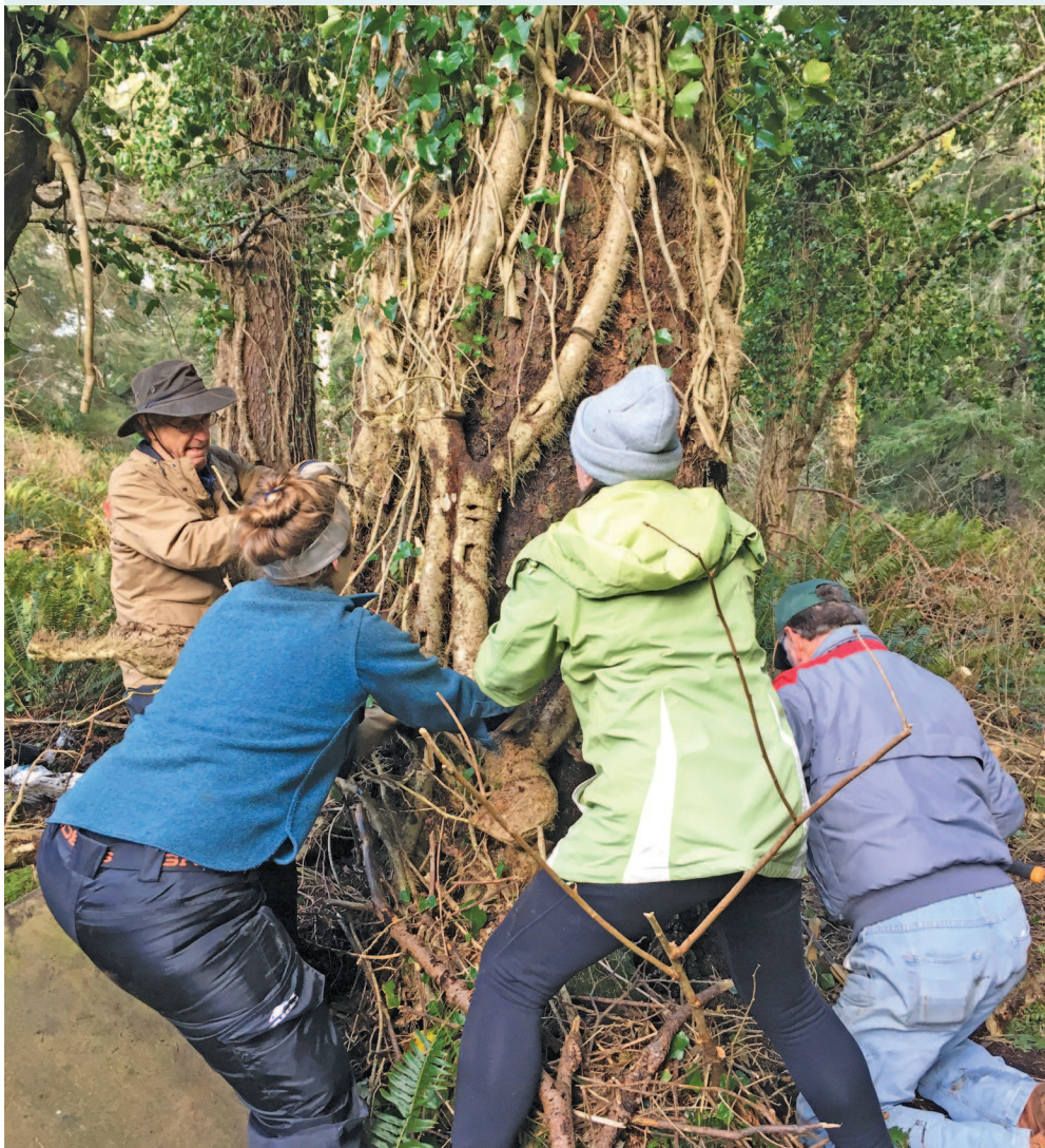
North Coast Land Conservancy

Volunteers work together to remove thick ivy vines creeping up a Sitka spruce at the North Coast Land Conservancy's Sand Creek Wetlands Habitat Reserve, near Skipanon Forest, in January 2018.