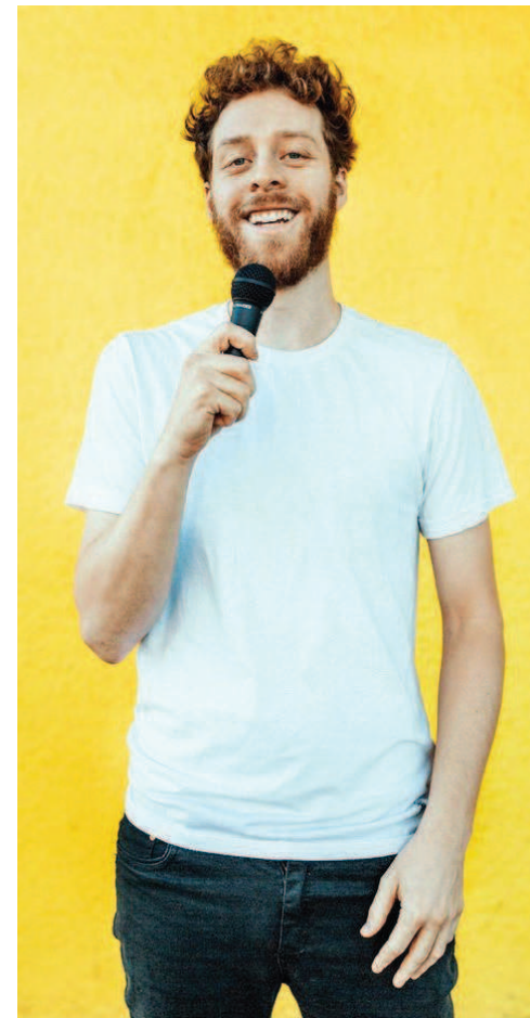
Labor Temple Bar