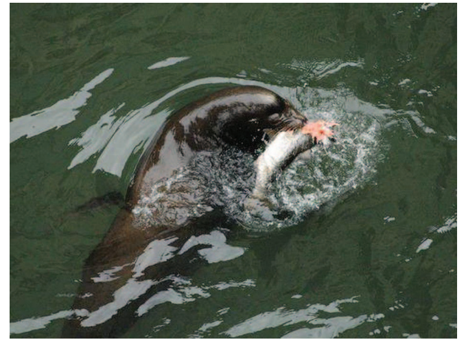
Oregon Department of Fish and Wildlife Sea lions have been eating steelhead and other fish at Willamette Falls in ever greater numbers.