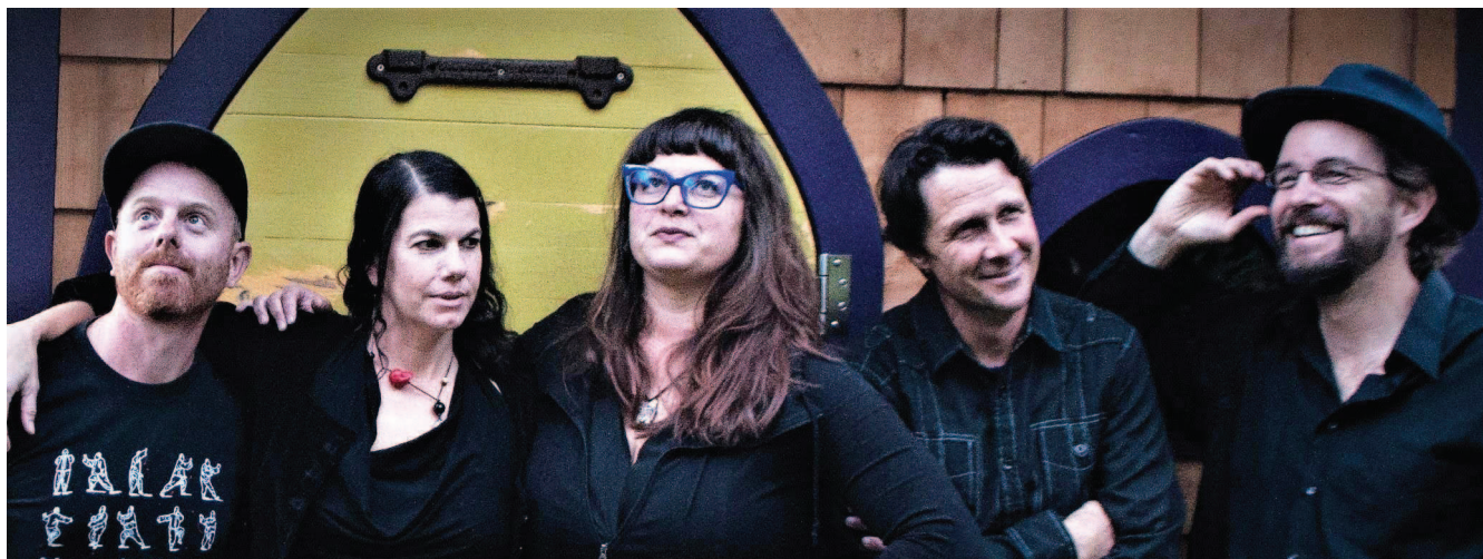
Astoria band Midas Digs.