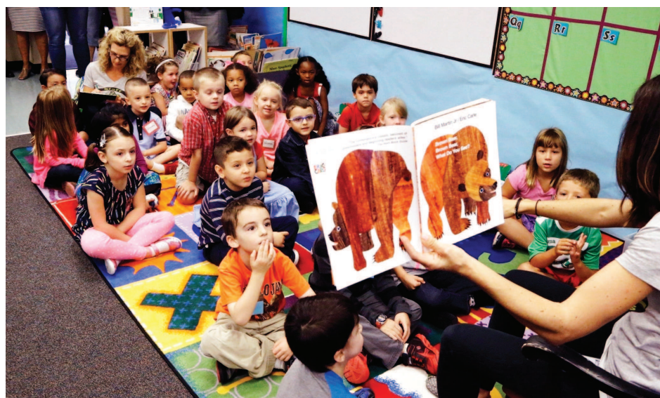
Students go through a lesson at Nancy Ryles Elementary School in Beaverton.

On the other hand, PERS is one of the better-funded public pension plans. Cumulatively, state pension plans amassed a $1.4 trillion deficit, because they generally are paying more in benefits than they receive in