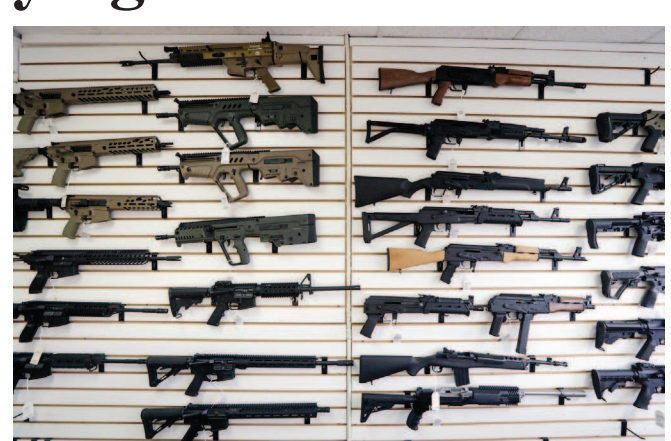
Semi-automatic rifles at a gun shop in Lynnwood, Wash.

"Starting today, young adults between the ages of 18 to 20 will have their rights to purchase semi-automatic rifles stripped away," said Dave Workman, a spokesman for the Bellevue, Washington-based Second