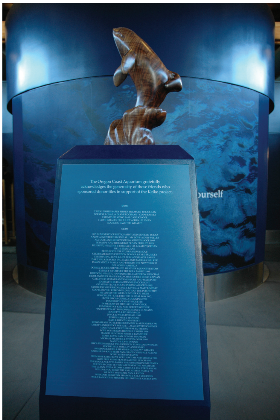
Oregon Coast Aquarium