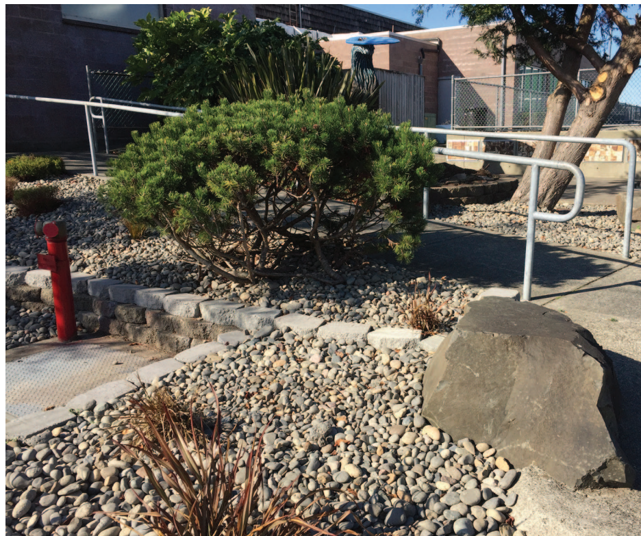
The Daily Astorian