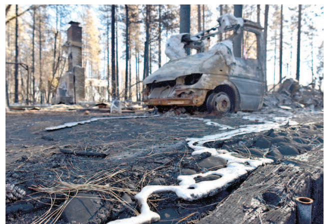
A stream of metal melted from underneath a vehicle leaves behind a grim reminder of how hot the Camp Fire burned.