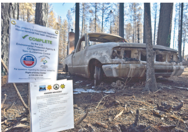
Signs indicate a property has been searched for hazardous materials.