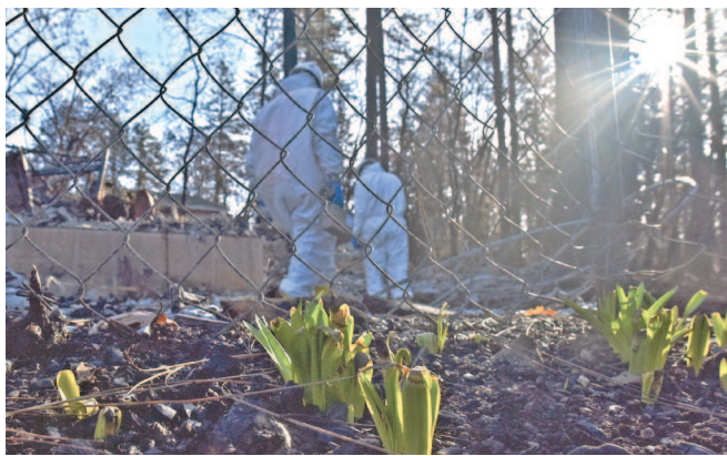
Plants begin to spring from the blackened ground near a destroyed home in Paradise.

Before hazardous waste can be removed, it has to be found. The only way to do that is for teams to go house to house and sift through the wreckage. What they find