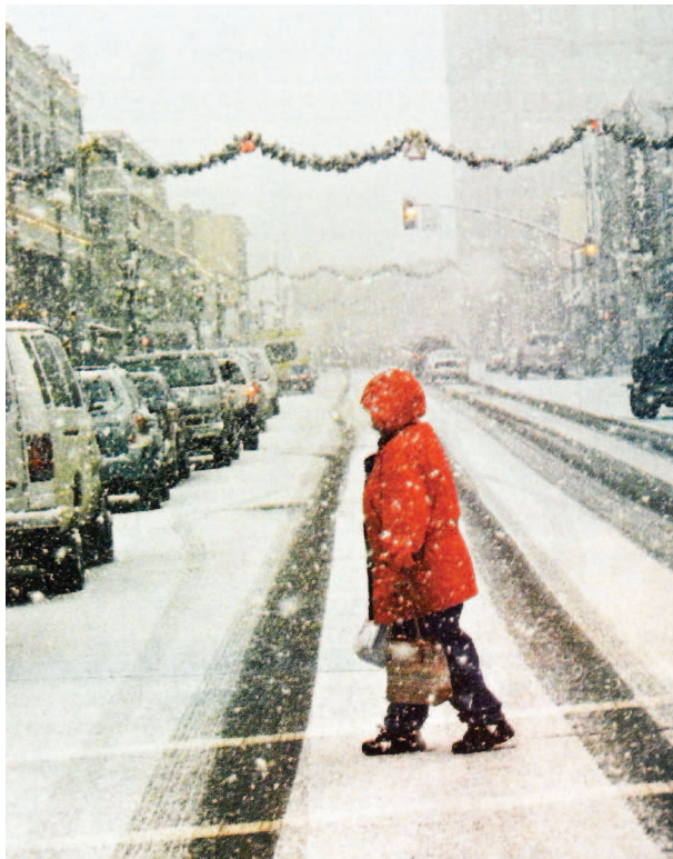
2008 — A pedestrian trudges across Commercial Street through a heavy snowfall that quickly came and went in Astoria.

The Naselle Youth Camp in Washington state may close in a year. Facing what some estimate to be a $6 billion budget deficit in the next two-year budget cycle, Washington Gov. Chris Gregoire's budget released Thursday proposes a number of cuts, including closing Naselle Youth Camp.