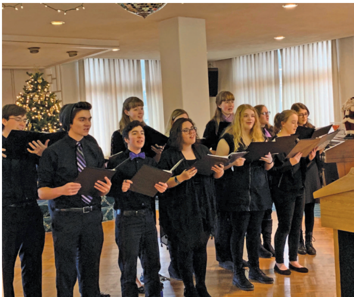
Astoria School District

A: There will be regular updates on the district website. We will also be out in our schools and in our community informing parents and community members of upcoming projects. We want the community to be actively engaged in helping us develop learning spaces for a modern education for our children. Beginning early next year, we will develop design advisory commit-