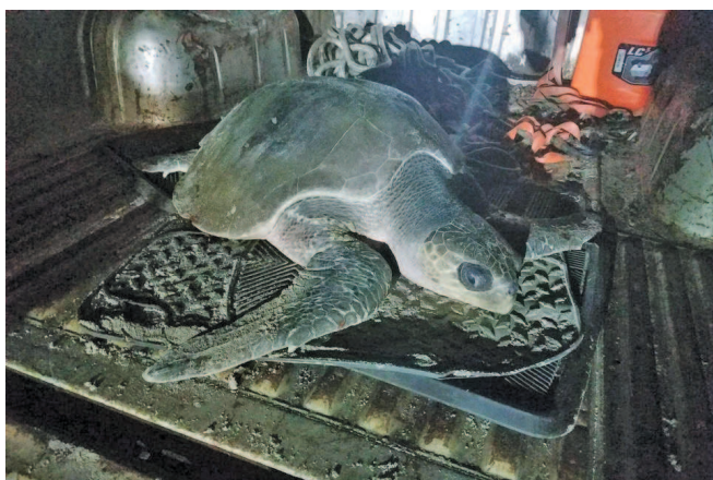
A sea turtle was stranded on the Oregon Coast.

On Saturday, a couple walking along the beach in Waldport spotted the second turtle, also a female olive ridley, and called the aquarium.