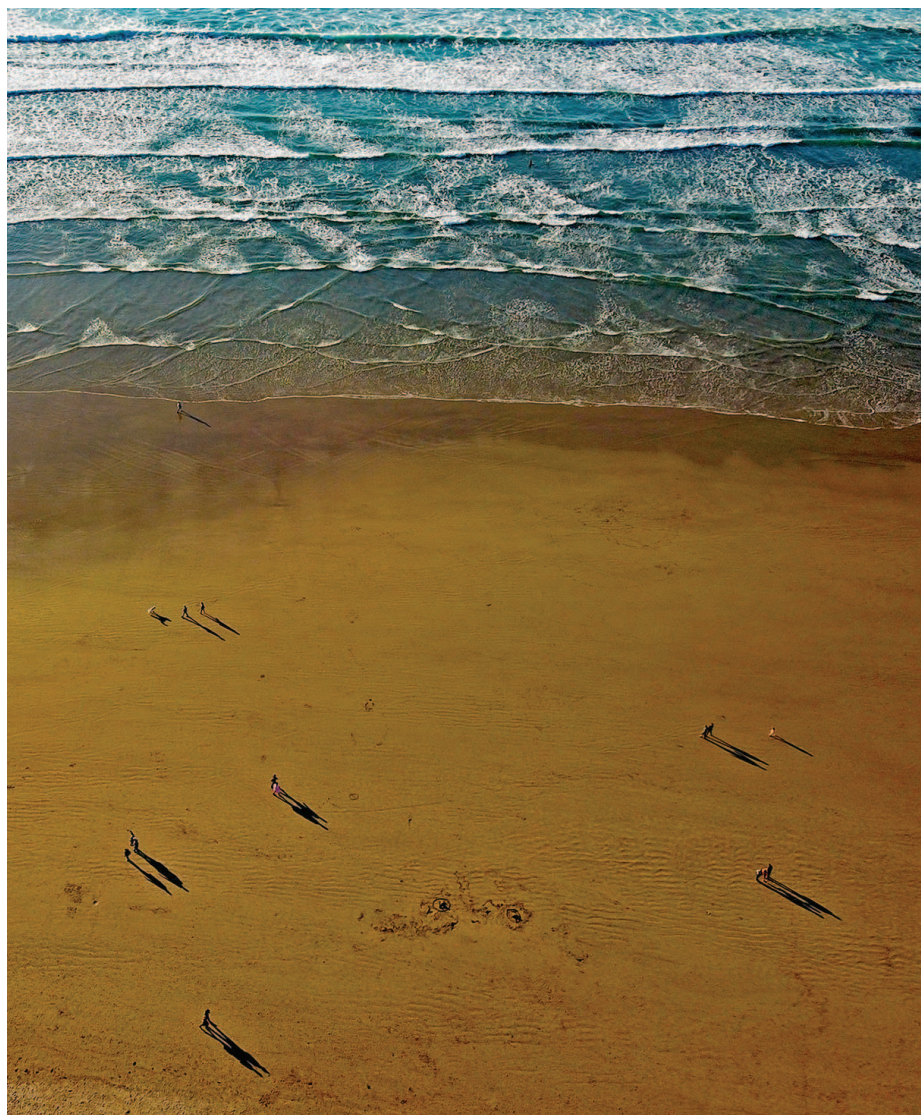
People walk near the surf at Cannon Beach.