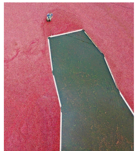
Justin Bogh moves cranberries through one of the Bogh Farm bogs during the fall harvest.