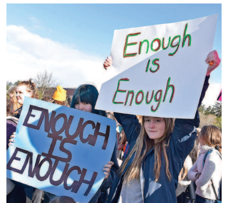
Astoria High School students hold up signs during a walkout in March to protest gun violence.