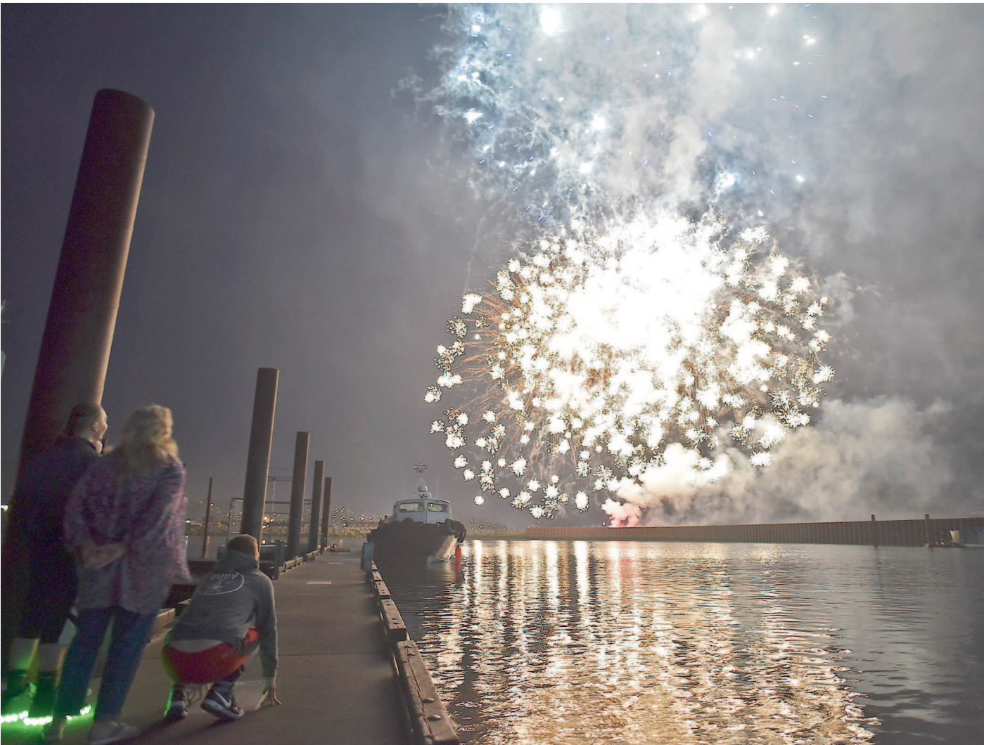
The fireworks display drew hundreds of people to the Astoria Riverwalk and the East Mooring Basin.

T he Daily Astorian takes a look back at some of the most memorable images from Clatsop County during the past year. Young people stood out this year, whether it was urging people to vote or demonstrating against the threat of violence in schools. Viewers might notice three drone photos — the newly acquired tool allows a new look at familiar subjects.