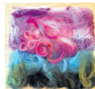
'Felted,' wool art by Seaside Yarn and Fiber.

host a group show and holiday art sale during December, featuring the work of artists who have shown in the gallery before. "An Art-Filled Holiday" will be an exciting and eclectic show with plenty of framed, original wall art and art prints available to purchase.