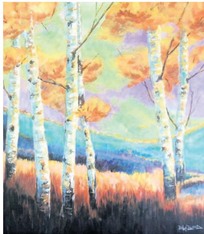
'Aspens,' oil on board by Blue Bond at Blue Bond Studio and Gallery.