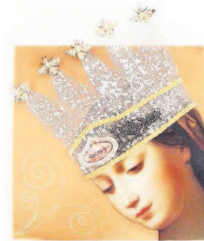
'Queen-Bee,' a work of mixed media by Patty Thurlby at SunRose Gallery.

yarn and craft shop, focuses on community building by offering a free Knit Night, plus a rotating selection of all-ages knitting and crafting classes.