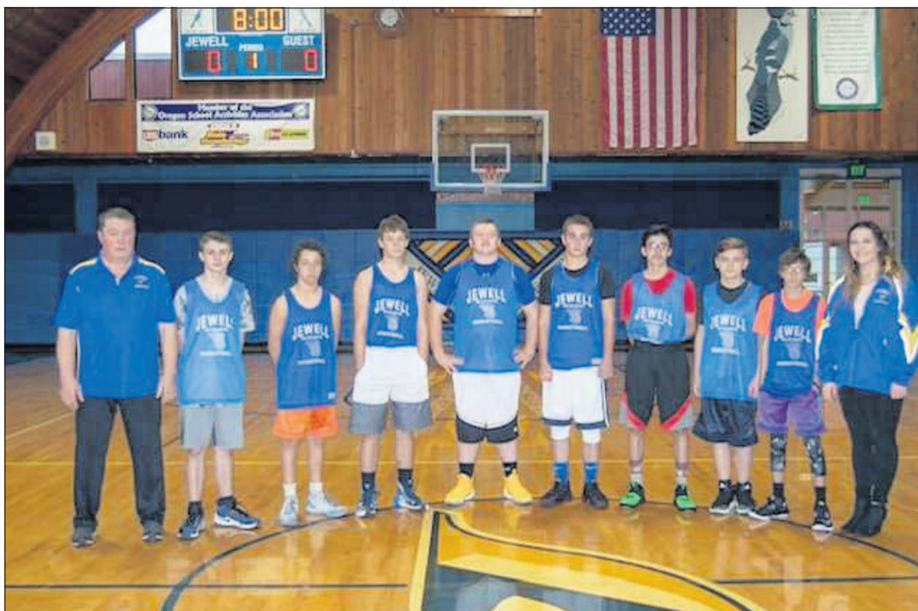
The 2018-19 Jewell boys basketball team.