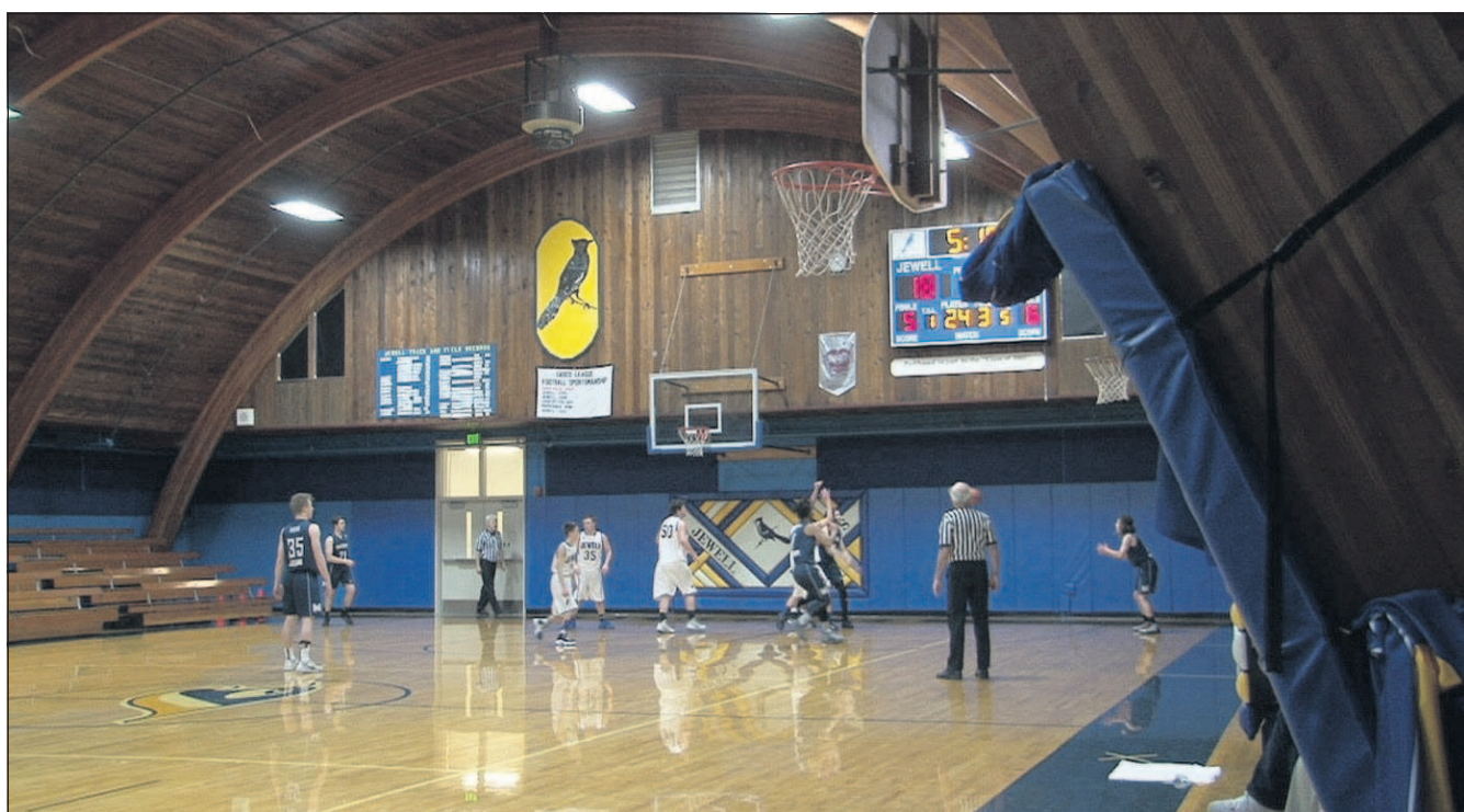
The Jewell 'dome,' home of the Blue Jays.